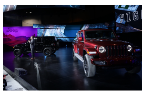
2020 Jeep Special Edition Wrangler and Gladiator Premium High Altitude