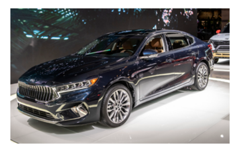
2020 Kia Cadenza