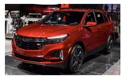
2021 Chevrolet Equinox