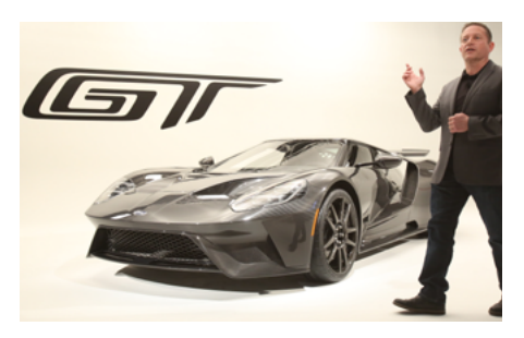
2020 Ford GT Liquid Carbon