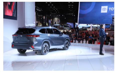
2021 Toyota Highlander XSE