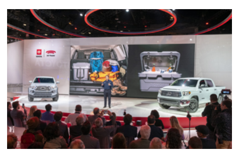
2020 Toyota Nightshade and Trail Editions