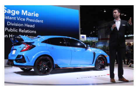
2020 Honda Civic Type R