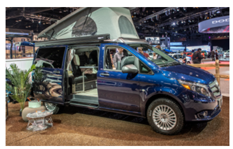
2020 Mercedes-Benz Metris Weekender