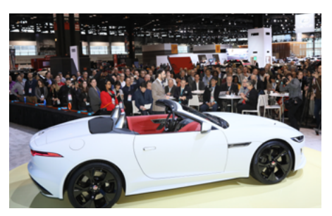
2021 Jaguar F-TYPE