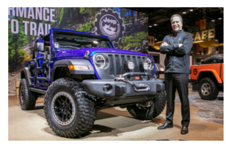
2020 Jeep Wrangler JPP 20 Limited Edition