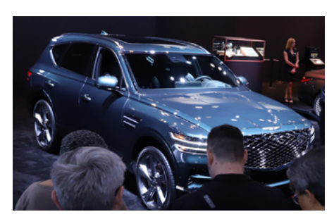
2021 Genesis GV80