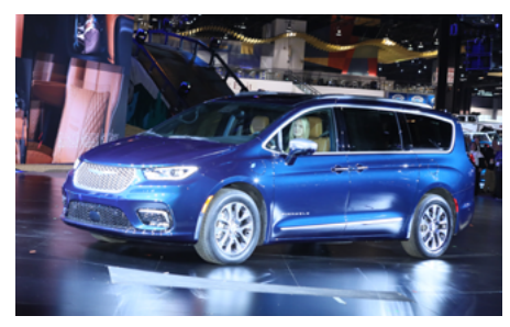
2021 Chrysler Pacifica