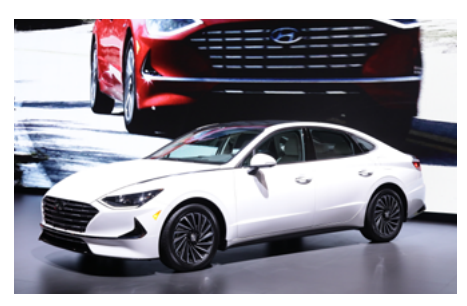
2020 Hyundai Sonata Hybrid