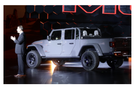
2020 Jeep Gladiator Mojave