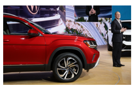
2021 Volkswagen Atlas