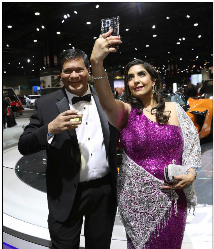
First Look for Charity at the 2022 Chicago Auto Show

At a time still challenged by a pandemic, 17 area charities on Feb. 11 shared more than $1.6 million raised by the 2022 Chicago Auto Show's benevolent event, First Look for Charity, and two attendees left with the keys to new vehicles.