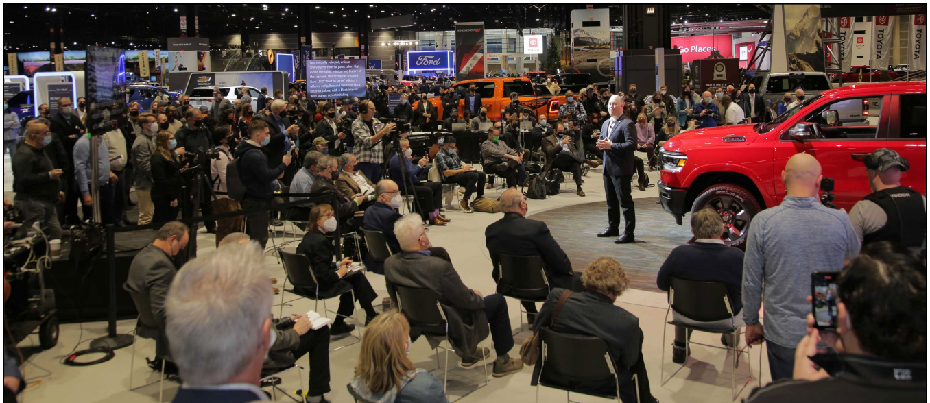
2022 Chicago Auto Show: Ram Press Conference

Fan favorites returned such as Camp Jeep (which celebrated its 18th year at the show), Ram Truck Territory and Subaru’s popular National Parks immersive exhibit and dog adoption. To date, 14 dogs were adopted from the show. New attractions this year featured an indoor 2022 Toyota Tundra test track and Ford’s two new indoor tracks to highlight its Bronco family of vehicles and its latest EVs, the F-150 Lightning and Mustang Mach-E.