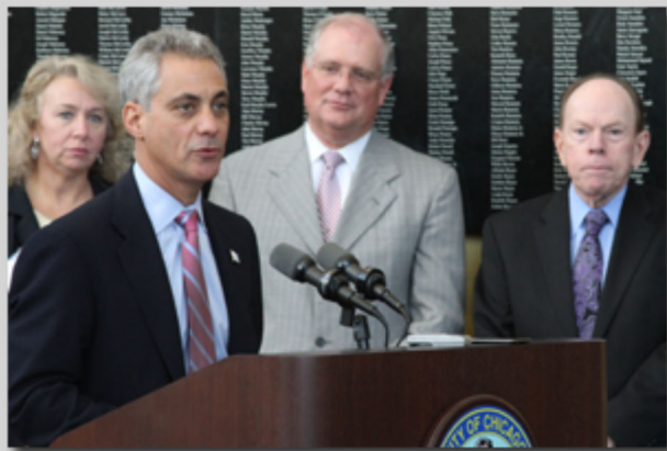
Chicago Mayor Rahm Emanuel

Organizers of the Chicago Auto Show are applauding the recent settlement at McCormick Place that secures lower prices for its exhibitors and foresees more growth for the city's biggest public show. More flexible work rules, expanded straight-time windows and lower prices for labor, food concessions and even parking will lead to bigger and better displays from auto manufacturers and a better experience for attendees, according to the show producer.